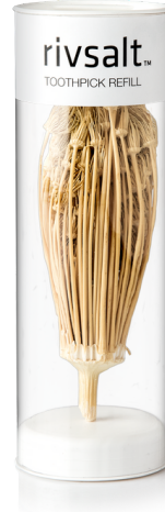
014 TOOTHPICK REFILL Extravagant Moroccan toothpick flower.