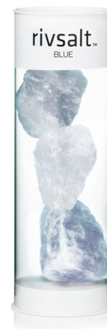
010 BLUE Extremely rare Persian blue salt rocks from Iran.