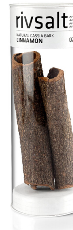
021 CINNAMON Cinnamon in the form of cassia bark.