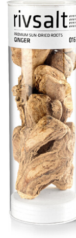
016 GINGER Premium sun dried roots from India.