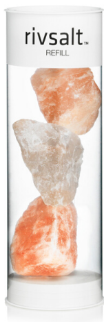
002 THE ORIGINAL Himalayan salt rocks from northern Pakistan.

Taste all the flavors and decide which ones are your favorites and use them with our large KITCHEN [005] product or on the dining table with our original RIVSALT [001] product.