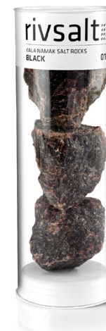
018 BLACK Kala Namak salt rocks from India.