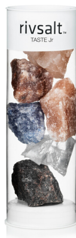
009 TASTE Jr Selection of 6 small salt rocks from around the globe.