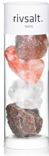
008 TASTE Selection 4 large salt rocks from around the globe.