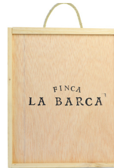
Wood Empty Box