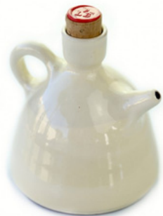
Oil Ceramic Dispenser