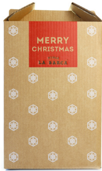
Christmas Gift Box