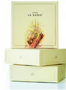
Gift Box "Finca La Barca" includes customization