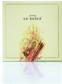
Empty Gift Box "Finca La Barca"