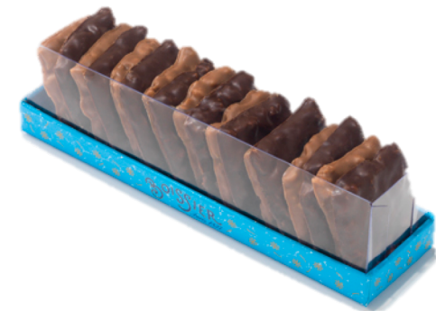
Small Transparente Slide – Nougatines Black and Milk Chocolate (100g)