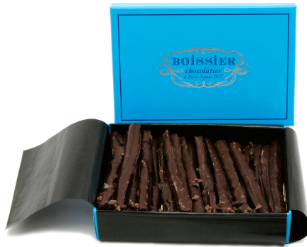
The Box (250g)

The Boissier orange peels are expressions of the covenant of Gourmet fruit and power of a pure dark chocolate.