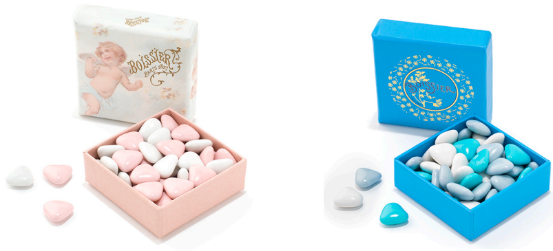
Small Angel and Blue box (50g)

Assortment of heart-shaped candies in pink and white or blue and white colors in a small box.