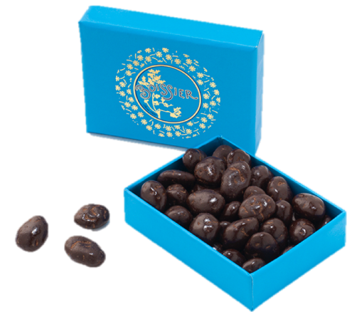
Medium Blue box (70g)